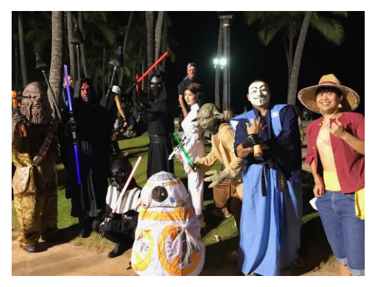
Photo 1 Appearance of the Halloween festival in Honolulu during the symposium term.

As a next symposium, ISTP30 will be held from November 1-3, 2019 at Vinpearl Halong Bay Resort in Ha Long City, Vietnam.