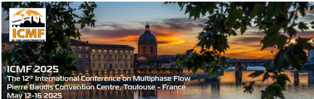
Figure 1: Announcement of the 12 th ICMF, held in Toulouse, France (2025).